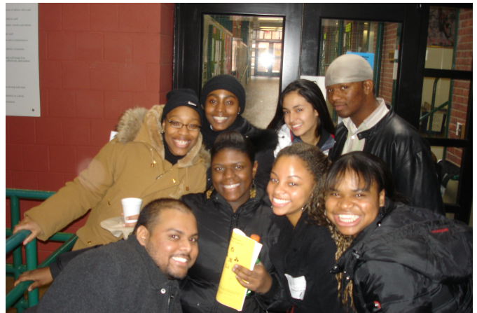
Enthusiastic students from Hartwick College spend their day in pursuit of knowledge

Cold and blustery weather cut into attendance at the Saturday eve-