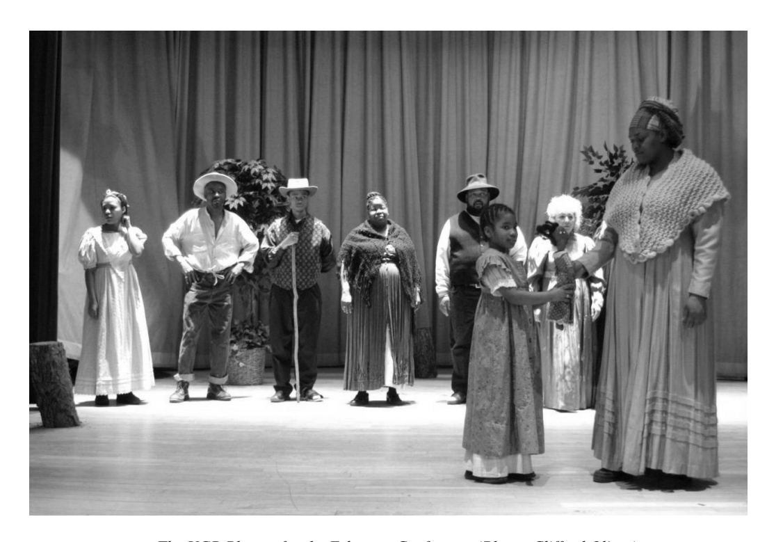
The UGR Players for the February Conference