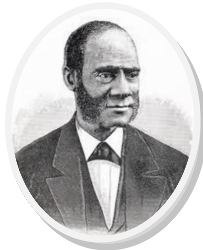
Henry Highland Garnet

Schooling came for Henry through the African Free School and the Phoenix High School for Colored Youth in New York City. Later he attended the Noyes Academy in New Hampshire and the Oneida Institute at Whitesboro near Rome, New York, where he studied theology. In 1839 Garnet came to