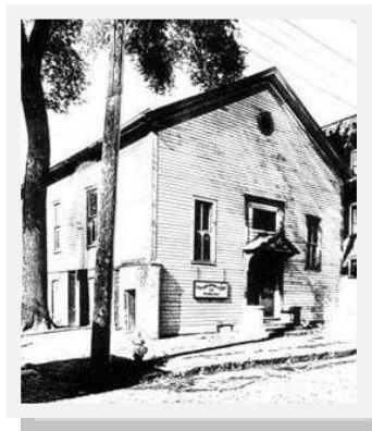
Liberty Street Church, Troy, New York, which is now commemorated with a historic marker on Liberty Street between 3rd and 4th Streets

preach a sermon before the United States Congress in 1865. Later in his life, in 1868, he was appointed President of Avery College in Pennsylvania, and in 1881 he was appointed Minister to Liberia where he died in 1882.