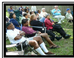
July 4th Oration 2009

Volunteers needed for work of URHPCR. Can you contribute time to the Jazz Event Committee, the Conference Committee, the Finance Committee, or the Building / Properties Committee? Do you like to maintain databases? Would you like to assist with fundraising? Join us in achieving the mission of URHPCR by volunteering your time and talents.